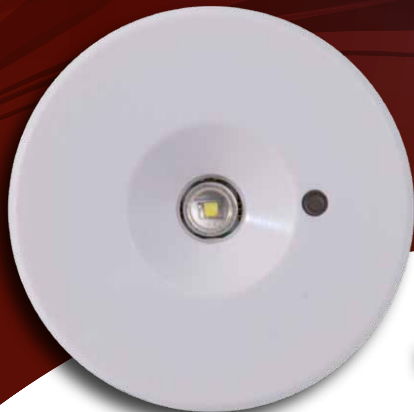
Gear and batteries fit through cut out

The Spot-LED is a flexible 3 hour, maintained and non-maintained emergency LED luminaire which delivers superb light output performance from a 3 watt single white LED.