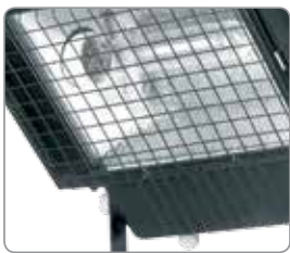
WFL/WG/SOL: Wire guard