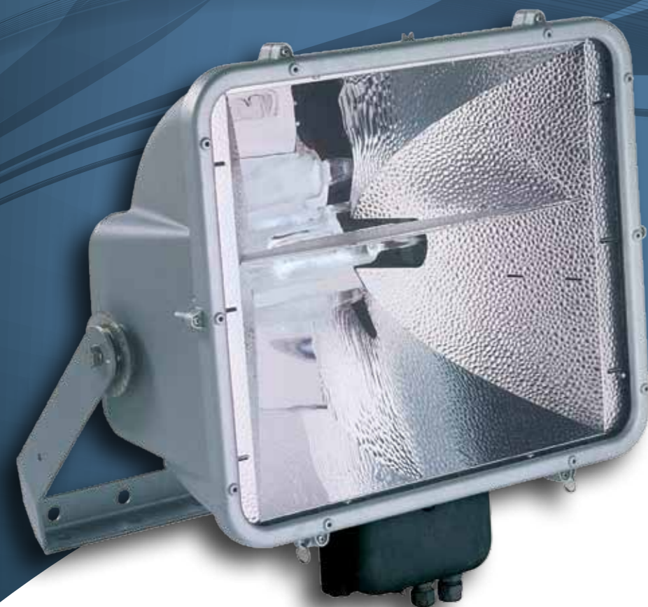
/SYN Symmetric narrow beam reflector

QDEL/C: Linear Long Arc Metal Halide with Cable Connection