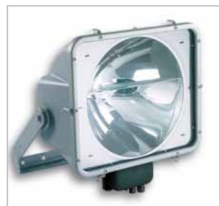
/HIC High intensity circular reflector