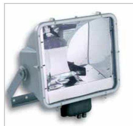
/ASN Asymmetric narrow beam reflector