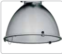
/GLASS: Glass front cover