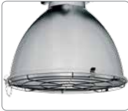
WG/HB: Protective wire guard