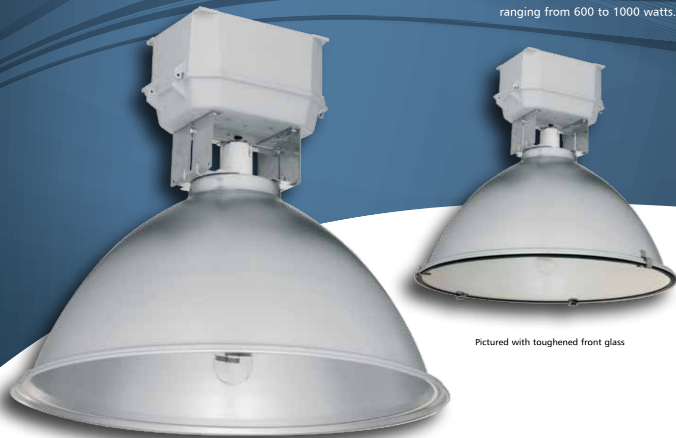
Pictured with toughened front glass

Designed and manufactured to comply with EN 60598 and are CE certified.