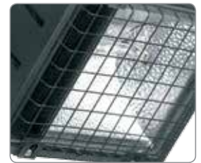
WFL/WG/HAM: Wire guard