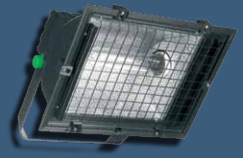
Roma Wire Guard Part number: WFL/WG/ROMA

For improved vandal resistance. Fixes directly to the front of the floodlight.