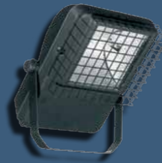
Solent 1 Wire Guard Part number: WFL/WG/SOL1

For improved vandal resistance. Fixes directly to the drop down front frame of the floodlight.