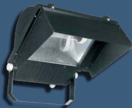
Solent/Mars Anti-Glare Visor Part number: WFL/AGV

Reduces light spillage in sensitive applications. Available as a kit for self assembly, fixes directly to the drop down front frame of the floodlight. (White to special order)