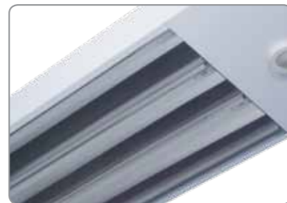
SPW/PC: Polycarbonate Cover