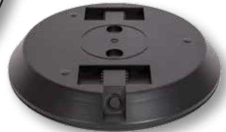
Side cable entry