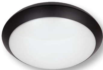
/BL: Black body