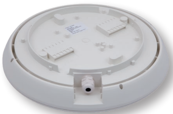
Side cable entry