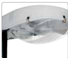
Pictured with polycarbonate bowl – supplied as standard