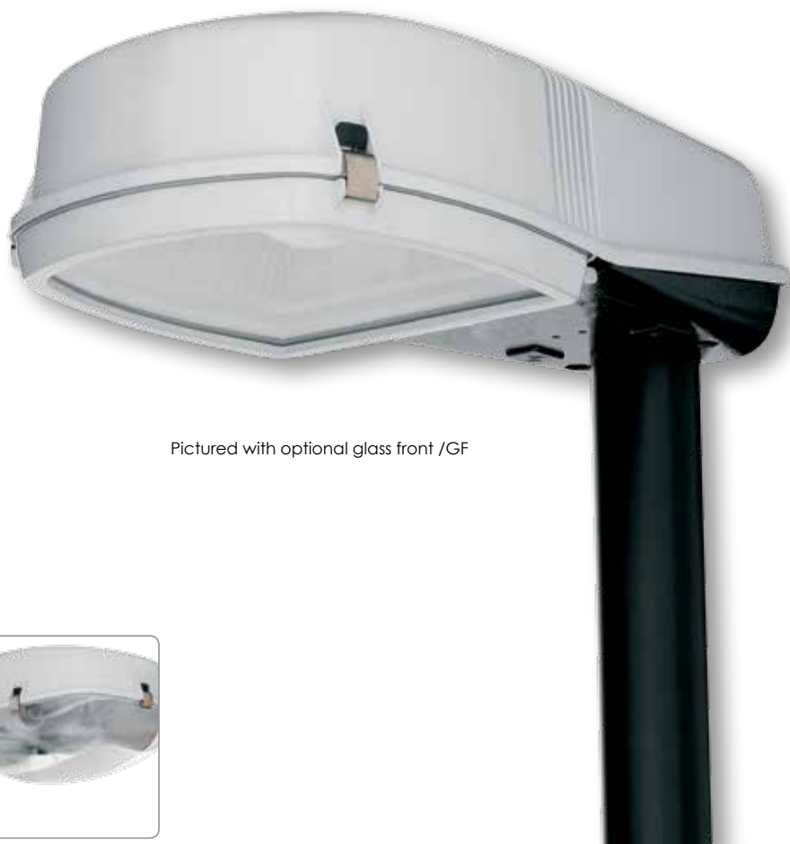
Pictured with optional glass front /GF